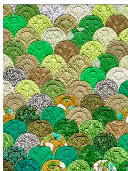
Beyond the Sea

Once you have made your decision as to which design you want to make, email or call me so I can send you the supply list for that pattern. I can also answer any questions you might have about any pictures or designs you're interested in. I'll be happy to provide advice on whether they will be applicable for this class.